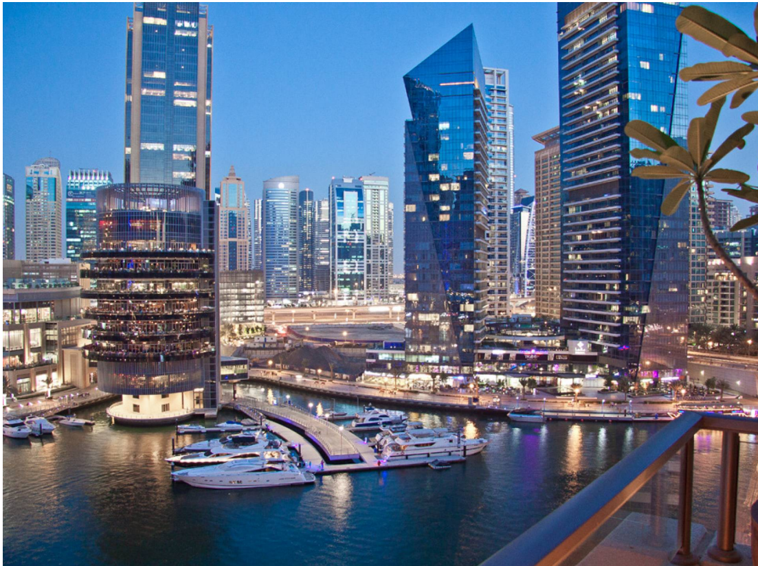
Luxury penthouse for sale in Dubai Marina

Cosmopolitan, stylish and modern, the Dubai Marina area offers urban living to its residents. The area combined with Jumeirah Beach Residence reported higher apartment sales than Downtown Dubai this year by AED 6.8 million. Closing transactions over AED 348 million, the Dubai Marina and Jumeirah Beach Residence area offers a price per square feet of AED 1889 for apartments above AED 5 million in comparison to Downtown Dubai's rather hefty AED 3775.5 per square feet, according to REIDIN. REIDIN data additionally reveals that these two areas sold 40 units in the first half of 2015.