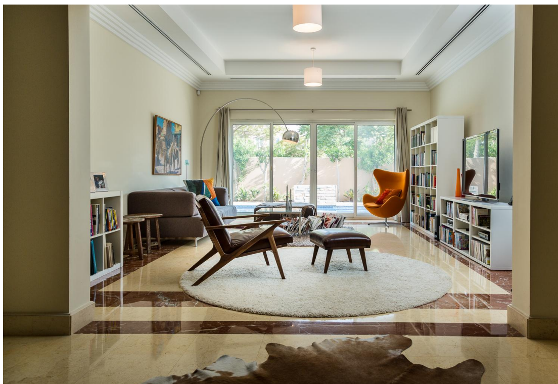
Villa for Sale in La Avenida, Arabian Ranches – Asking Price AED 11,200,000 - View details