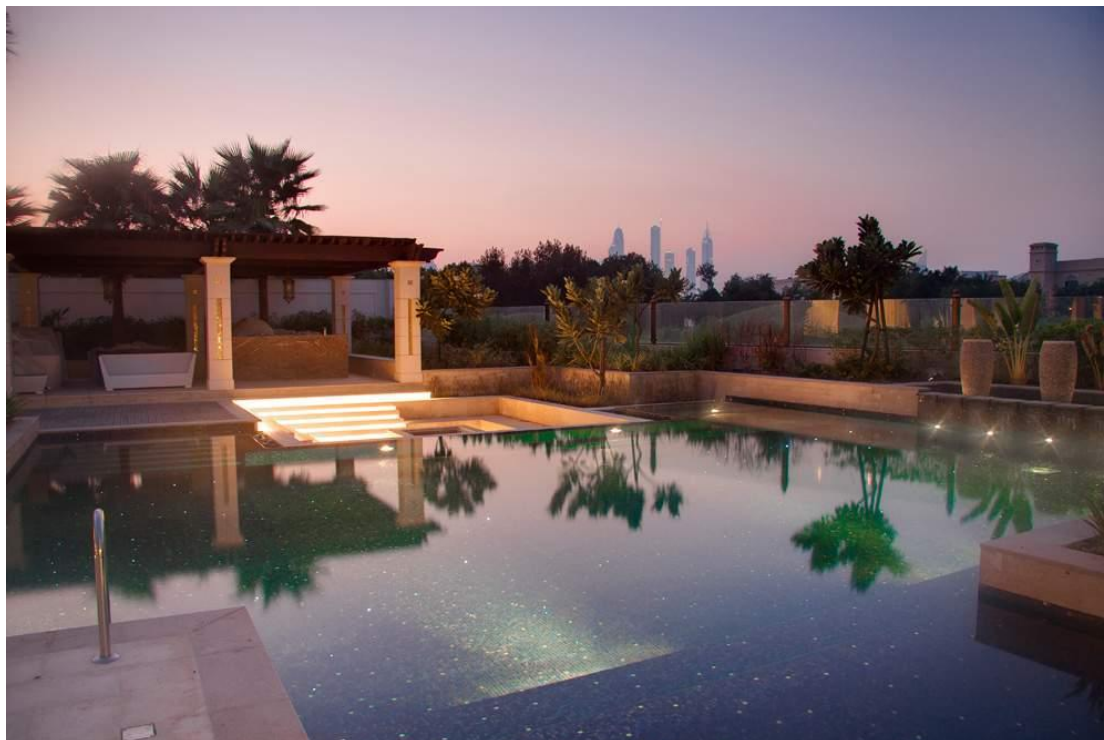
Villa for Sale in Emirates Hills – Asking Price AED 175,000,000 - View details