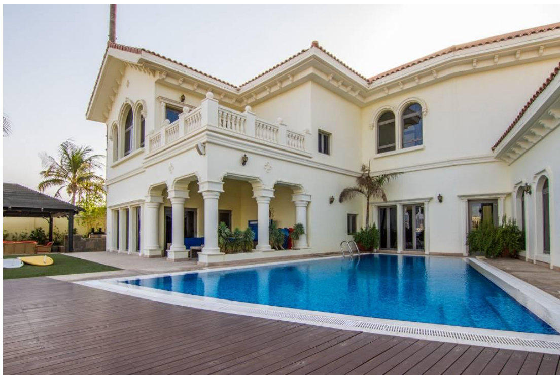
Signature Villa for Sale in Palm Jumeirah – Asking Price AED 64,900,000 - View details

FEATURED VILLAS FOR SALE IN THE MOST RELEVANT VILLA DEVELOPMENTS: